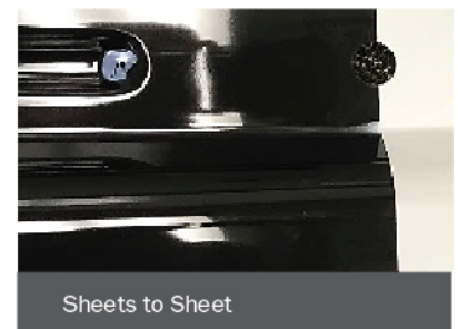
Sheets to Sheet